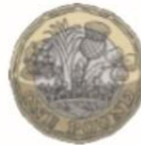
£1 One Pound