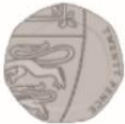
20p Twenty Pence