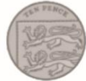
10p Ten Pence