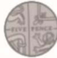
5p Five Pence