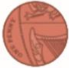
1p One Penny