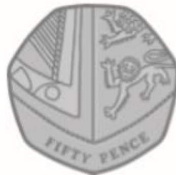
50p Fifty Pence