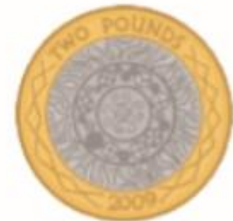
£2 Two Pounds