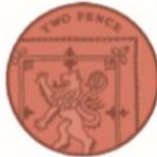
2p Two Pence