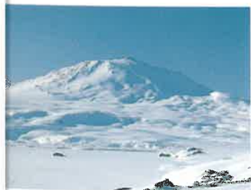
Mount Erebus, an active volcano in Antarctica

Antarctica is surrounded by new ocean made by spreading ridges (pp. 24–25)