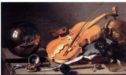
Vanitas with violin and glass ball by Pieter Claesz (1628)