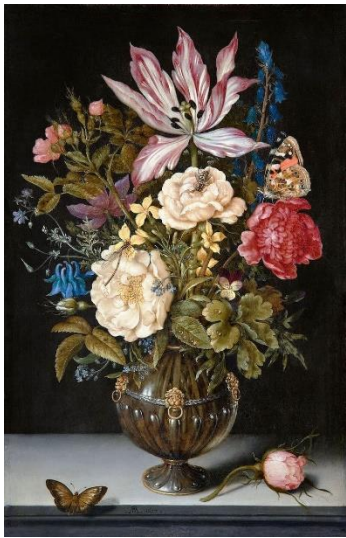
Still Life with Flowers by Ambrosius Bosschaert (1617)

https://www.tate.org.uk/art/art-terms/s/still-life