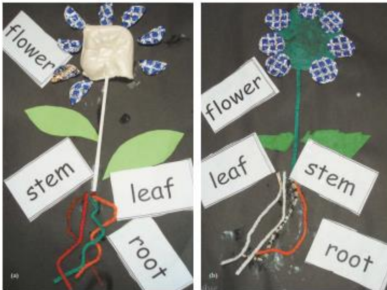
Figure 10: Some plants 'created' by children (at The Cowickh School) (a) flower - egg box and milk bottle tops; leaf - green card; stem - drinking straw; root - pipe cleaners. (b) flower - tissue paper and milk bottle tops; leaf - green card; stem - pipe cleaner; root - pipe cleaners.

An example of a homemade flower without the extra information about each part.